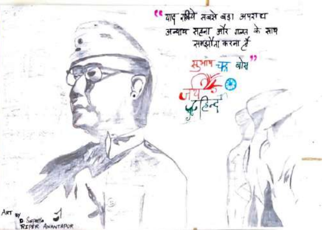
Celebration of Netaji Subhash Chandra Bose Birth Anniversary as Parakrama Divas-2021 commemorating the great sacrifices on 23 rd , January 2021.