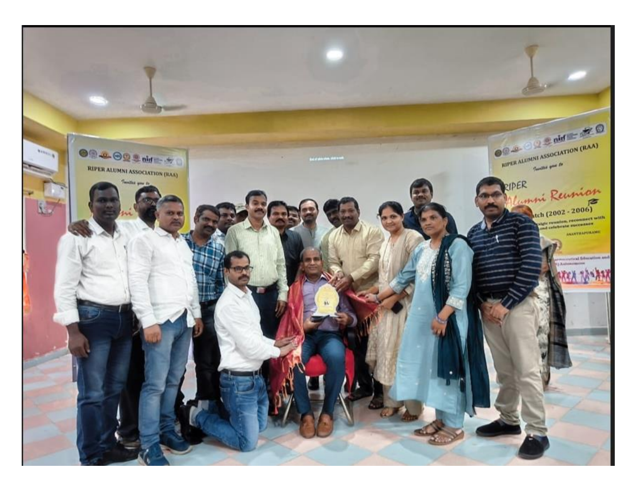
Felicitation to the Principal