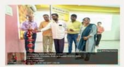
Inauguration of the meet by lighting the lamp