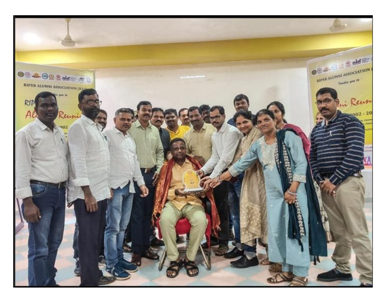
Felicitation to the Vice-Principal