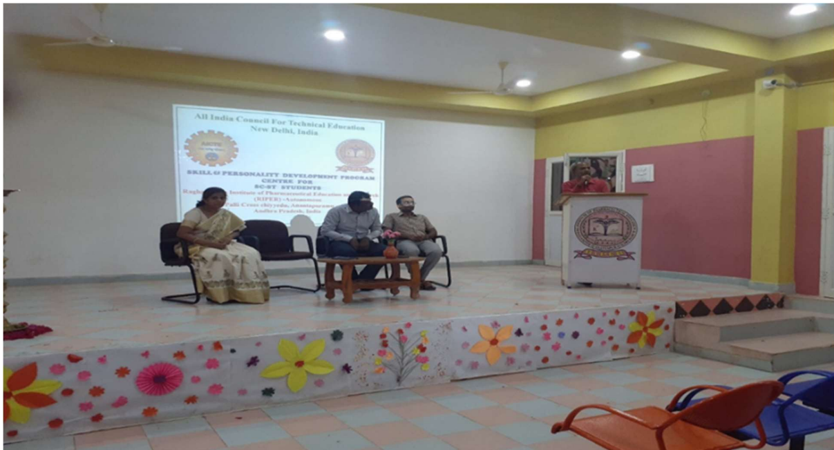
LANGUAGE AND COMMUNICATION SKILLS DEVELOPMENT PROGRAMME (03-04-2019)