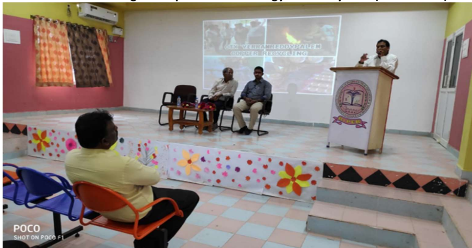
Importance of technical skills of self-employment (17-08-2019)