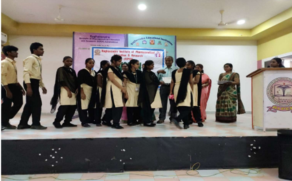
General knowledge & Impact of Technology on rural youth (20-01-2020)