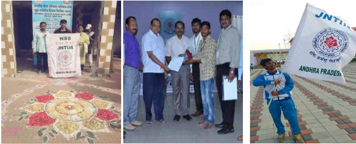
Selected for inter university cricket meet for JNTUA Ananthapuramu held at Mysore