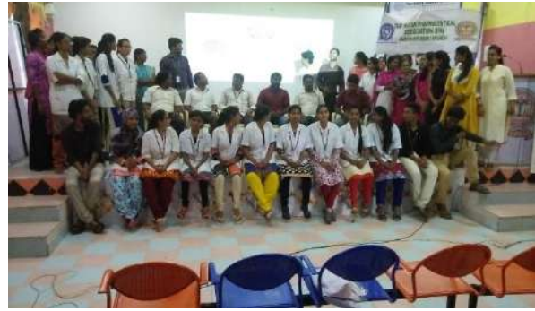
IPA- QUIZ Competition 03-10-2018