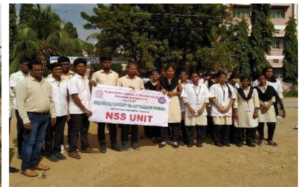
Mosquito Awareness, House Hold Sufficiency and Waste Management 17 th and 18 th Dec 2018