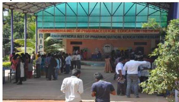
Release of Souvenir on National Conference on “Dynamics of Innovations and Intellectual Property Rights