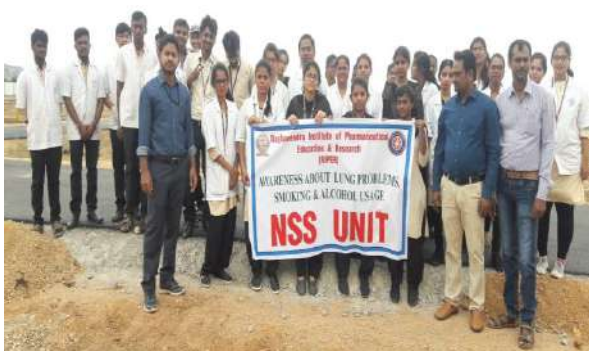
Awareness about Lungs Problem, Smoking and Alcohol Abuse on 16 th -22 nd Dec 2018