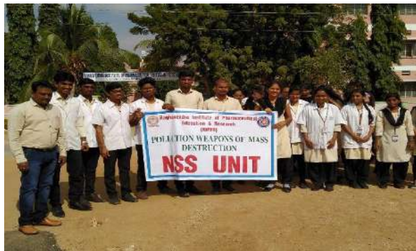
Organic forming, Mushroom Cultivation, Pollution Weapons of Mass Destruction on 16 th & 17 th Dec 18