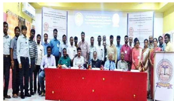
Release of Souvenir during Continuing Education Programme on “Translational Models in Teaching and Research: A way to build Socially Sensible Pharmacists