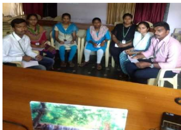
Astrazeneca Skype interview