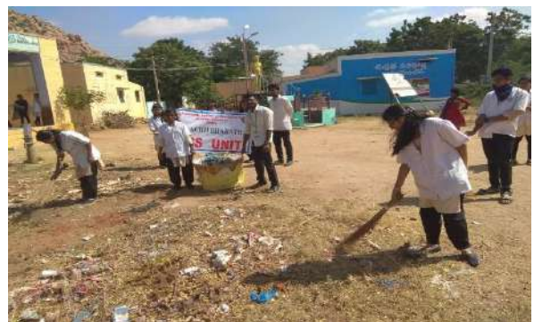
Road Safety Programme and Swachh Bharat on 15 th & 16 th Dec 2018