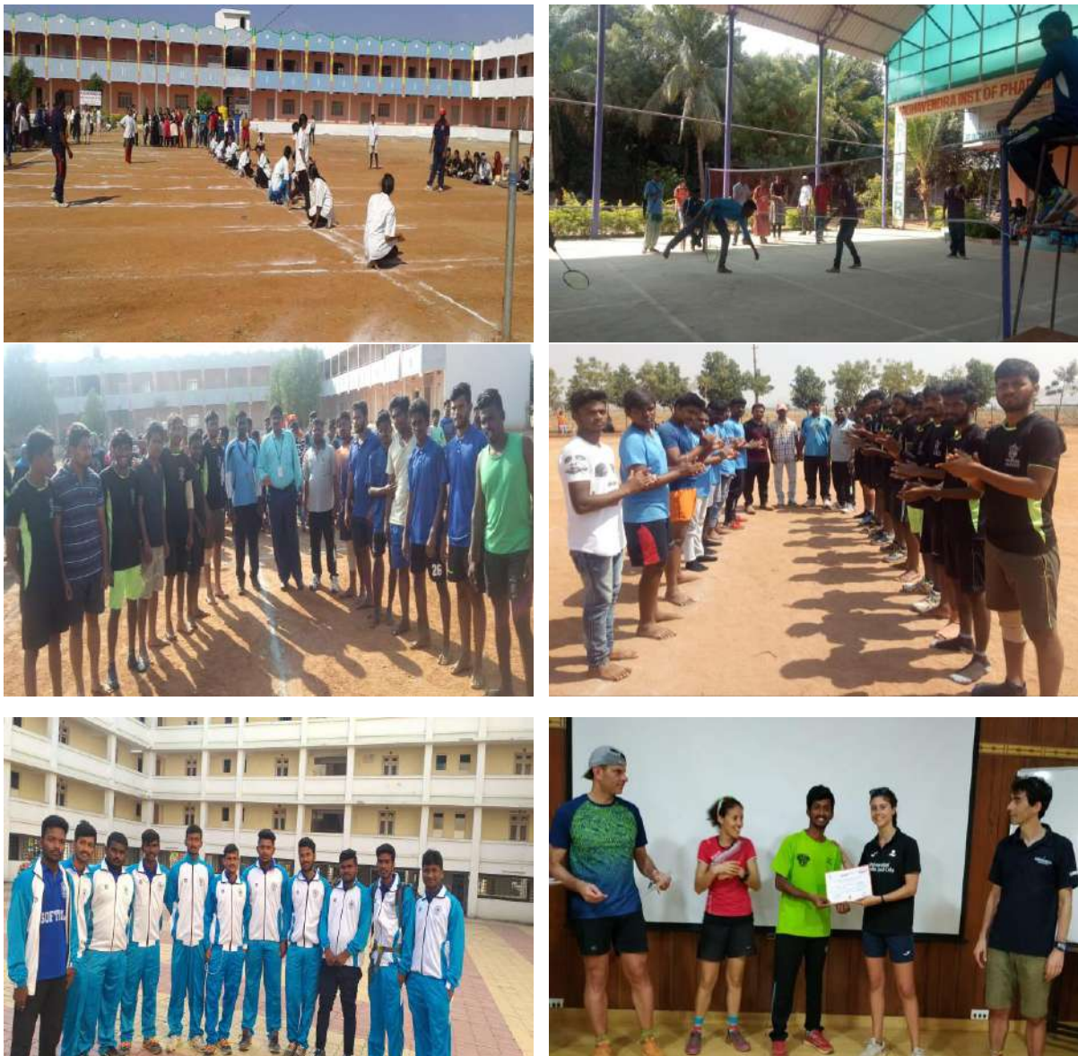
Participated in ALL INDIA INTER UNIVERSITY SOFTBALL TOURNAMENT held in Latur (Maharashtra)