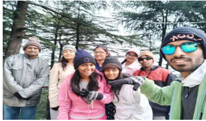
Adventure Training Programme at Dharmashala 02-11-2018