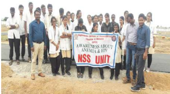
Awareness about Anemia, HIV, Arthritis Infection 16 th -22 nd Dec 2018