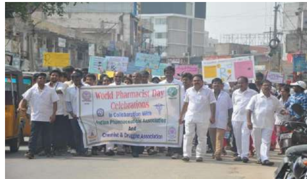
World Pharmacist day celebration on 25 th Sep 2018