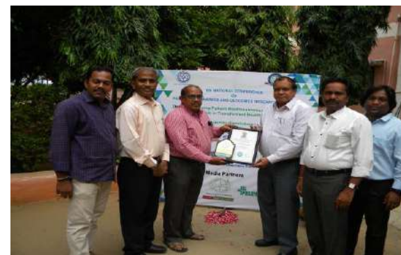
9 th National conference on Pharmacoeconomics and Outcomes Research (PE & OR) – Enhancing Patient Health outcomes & Pharmacists Role in Transformed Healthcare System