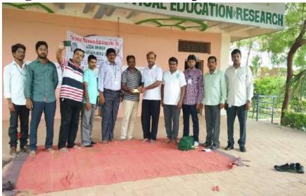
Medicinal Garden Maintenance 18-06-2018