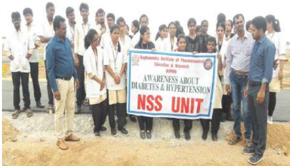
Awareness about Diabetes and Hypertension 16 th -22 nd Dec 2018