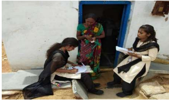
Teachers Day games Conducted on 05/09/18 Defecation awareness Programme 06/09/18