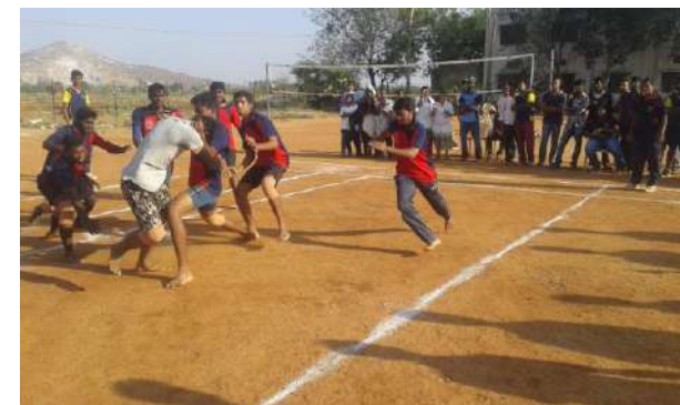
Sports week celebrations