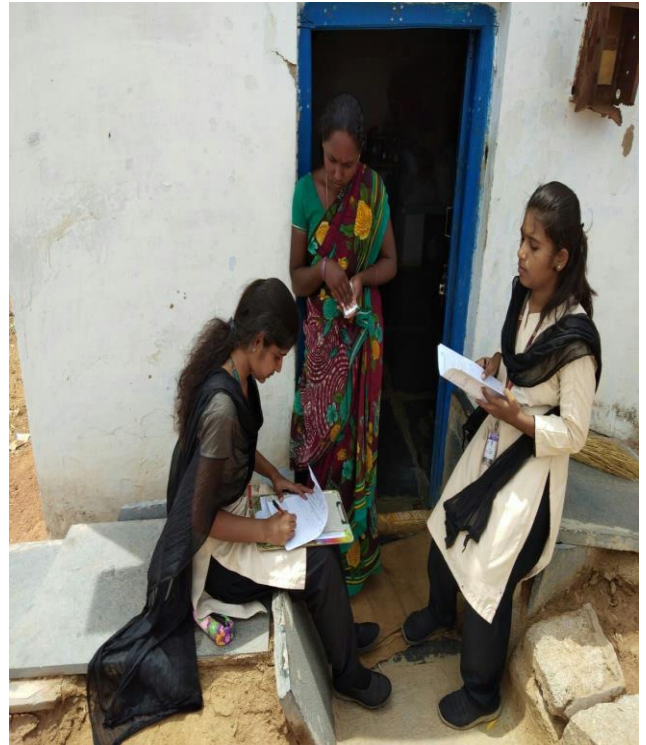
Open Defecation Avoidance Programme