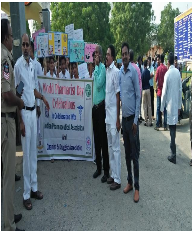
World Pharmacists Day Celebrations